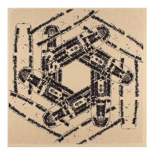
Figure 4. Charles Campbell, Untitled (Hexagon) , 2005. Oil and vellum on canvas, 18 x 18 inches.

Compared to the works of Bailey, Donkor, Flowers, Hastanan, Hazoumé and Pindell, Charles Campbell's untitled mixed media canvas work of 2005 (Figure 4) is especially abstract. Yet Campbell, a Jamaican-born, Britain-trained, Canada-based artist (b. 1970), has said that his practice is concrete, deeming it 'primarily concerned with mapping and questioning the relationship between meaning and image as they relate to my personal and cultural background'. At the same time, Campbell does not advance a functional role for art, in which the visual is truthful documentation and historical illustration. Instead, his intersecting and overlapping representation