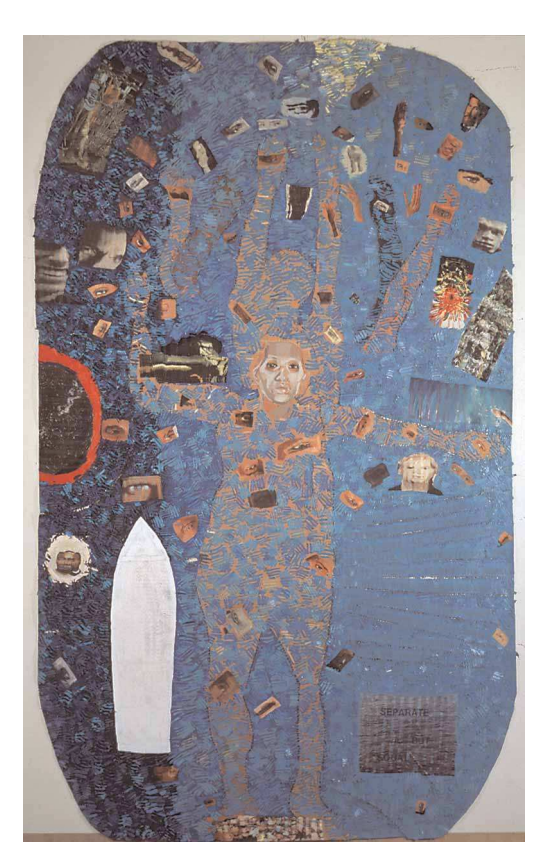
Figure 2. Howardena Pindell, Autobiography: Water/Ancestors/Middle Passage/Family Ghosts , 1988. Mixed media, 118 x 7 inches.

The Description is a key component of Howardena Pindell's Autobiography: Water/Ancestors/Middle Passage/Family Ghosts (Figure 2). In this 1988 collage, it is a bluntly shaped, lightly coloured cutout that is affixed to the uneven canvas surface. The vessel is surrounded by dozens of animated elements, including a fantastically conceived self-portrait of the artist (b. 1943). Both her form and the boat are vertically oriented, but Pindell's standing figure is a much more complex monument, presenting eight arms that radiate outward and upward like hands on a clock. This body is especially reminiscent of the many-limbed representations of Hindu gods in traditional, Indian sculpture and of Leonardo Da Vinci's Vitruvian Man (c.1487). In contrast to these art-historical paradigms of engaged beauty and grace, the artist presents a self that is a thickened shape, emphatically stolid and grounded. By implication, this body appears powerful, and, indeed, its strong, raised arms might be read as power salutes, the