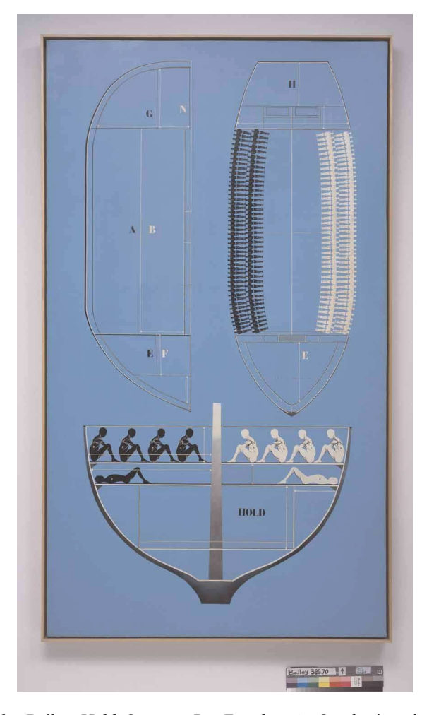
Figure 1. Malcolm Bailey, Hold, Separate But Equal, 1969. Synthetic polymer paint, presstype, watercolor and enamel on composition board, 7 feet x 48 inches. Gift of Barbara Jakobson and John R Jakobson (386.1970). Museum of Modern Art, New York.

down its middle. As part of Bailey's 'Separate Not Equal' series of paintings and drawings first exhibited in New York in 1969, Hold was a pointed critique of American racial segregation. Moreover, Bailey announced himself to be a student of history because the series' title invokes the language of the 1896 United States Supreme Court case, Plessy v. Ferguson, in which the Justices ruled that separate public accommodations for whites and non-whites was legally permissible, provided they were comparable and equal.<sup>7</sup> Mirroring the stark, lived realities of a racist society, Hold is, nonetheless, a visual reinterpretation of racial authority and rule, for Bailey makes both black and white men disempowered subjects and helpless victims trapped in the same boat. Bailey thus presses audiences - black and non-black,